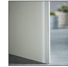
1/2" White Laminated, 10% Opacity, Low Iron GMI