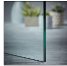
3/8" Clear Tempered GLS