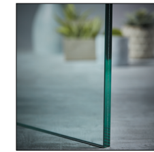
1/2" Clear Laminated w/.03 Interlayer GLU