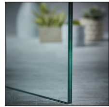
3/8" Clear Laminated GLR