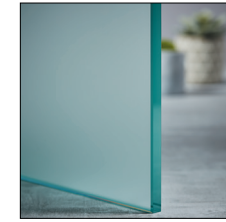
1/2" Velour Satin Etch (1-side) GMD