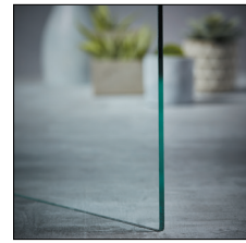
1/4" Clear Tempered GLA