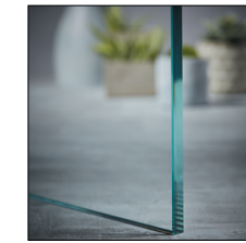
1/2" Clear Tempered, Low Iron GLY