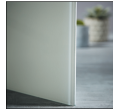
1/4" White Laminated, 10% Opacity GMA