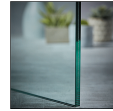
1/2" Clear Laminated w/.03 Acoustic Interlayer GLX