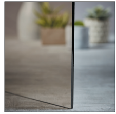
1/4" Bronze BRZ System 3000 & WireWorks only