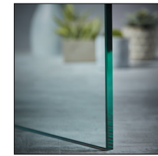
1/2" Clear Tempered GLT