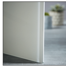
3/8" White Laminated, 10% Opacity, Low Iron GMH