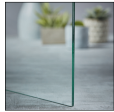
1/4" Clear Laminated GLB