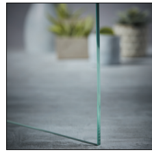
1/4" Clear Tempered, Low Iron GLM