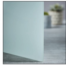
1/4" White Laminated GLC