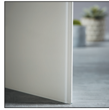
1/4" White Laminated, 10% Opacity, Low Iron GMG