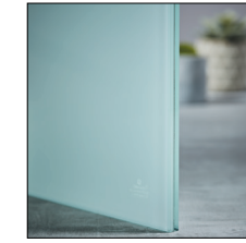
1/2" White Laminated, 65% opacity GMF