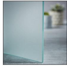
1/4" Velour Satin Etch (2-sides) GL2 Connection Zone only