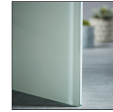
1/2" White Laminated, 10% Opacity GME