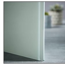
3/8" White Laminated, 10% Opacity GMC