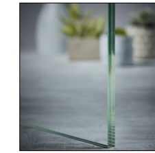
1/2" Clear Laminated w/.03 Interlayer, Low Iron GLI