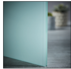
3/8" White Laminated GLQ