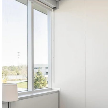
EVOKE ARCHITECTURAL WALL