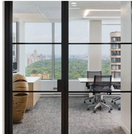
GENIUS ARCHITECTURAL WALL