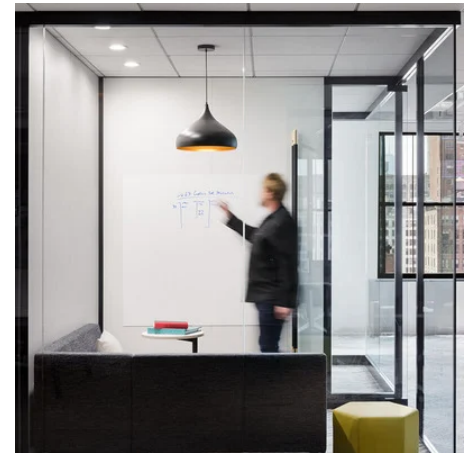
LIGHTLINE ARCHITECTURAL WALL