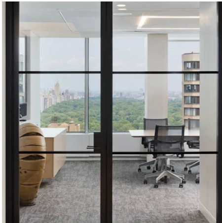
GENIUS ARCHITECTURAL WALL